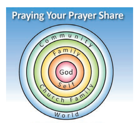
Motivated by God's Love and Love for Others